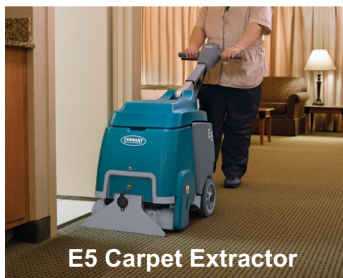
E5 Carpet Extractor