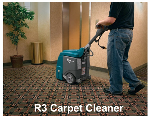
R3 Carpet Cleaner