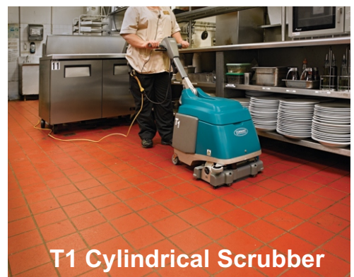
T1 Cylindrical Scrubber

Contact your Wesclean Sales Representative today for more information.